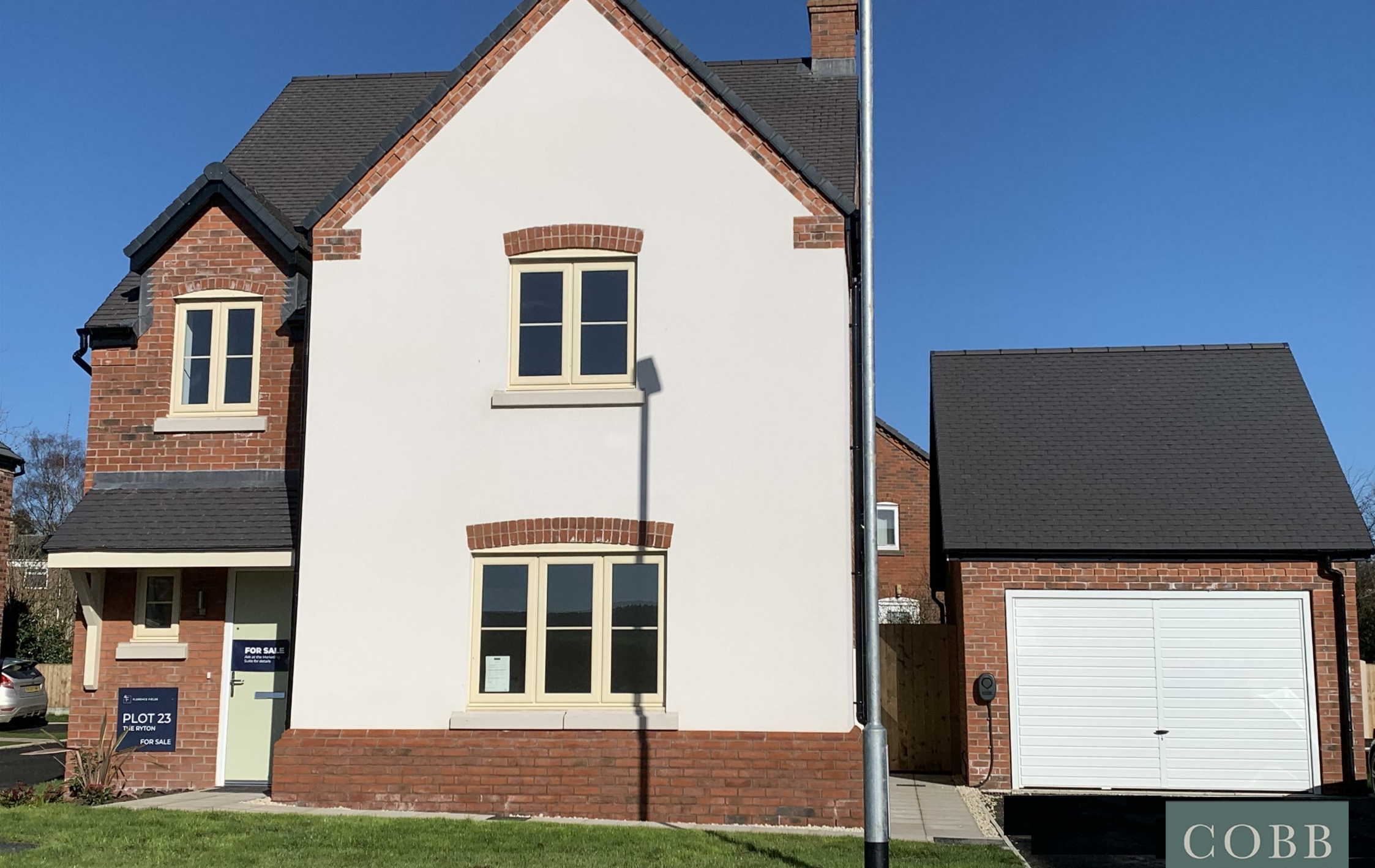
The Ryton, Plot 23, Florence Fields, Leintwardine, SY7 0DF Prices From £389,995